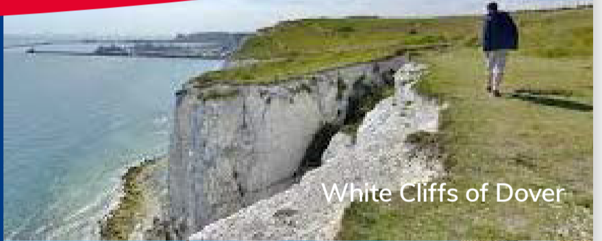
White Cliffs of Dover